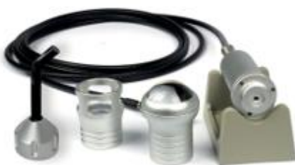
BH9014 MULTIFUNCTION THERAPY HANDPIECE