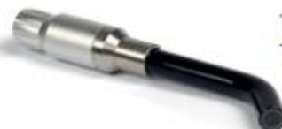
TT5108 THERAPY TIP 60°